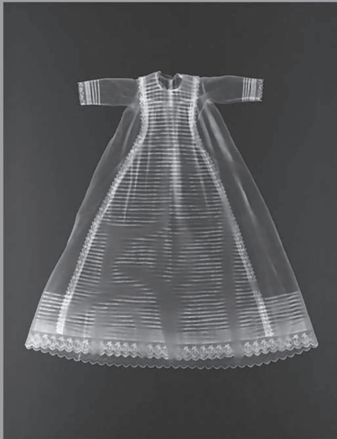
ADAM FUSS. From the series My Ghost, 1999, b.1961, British | Gelatin-silver print (photogram), 60 x 43 1/2 in.

THE SONDR A GILMAN AND CELSO GONZALEZ-FALLA COLLECTION OF PHOTOGRAPHY SEPT. 17, 2011 – JAN. 8, 2012